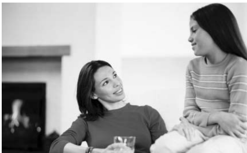
The Parental Notification and Intervention Act, hailed as the toughest piece of legislation of its kind, would protect parents’ rights to intervene and stop an abortion from being performed on their minor daughter.

See Abortionists Rush to Get to Teens Before Parents ... page 7