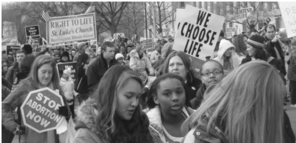
NPLA members back up their opinions with action. Scores of members and staff were out in force collecting petitions for the Life at Conception Act among the pro-lifers who braved the cold January weather to mark the anniversary of Roe v. Wade .

Members also expressed a strong desire to protect unmarried minors from