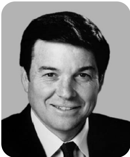
Congressman Duncan Hunter (R-CA) has introduced a new Life at Conception Act to overturn Roe v. Wade in Congress.