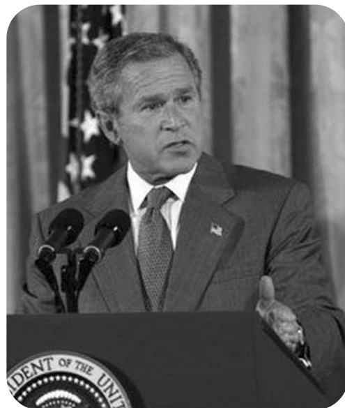
The President's Mexico City Policy has come under attack in the Senate.

On September 1, the President moved to strengthen the ban on tax-funded abortions.