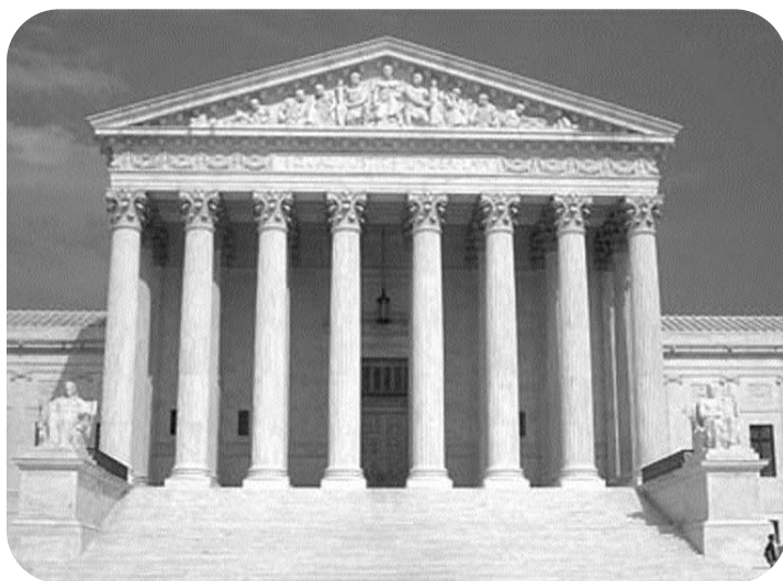
Pro-life Senate gains in the upcoming elections could clear the way for the confirmation of pro-life Supreme Court and federal court justices.

See Ouster of Pro-Abortion Radicals... page 6