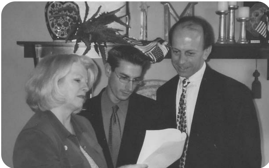
National Pro-Life Alliance staff meets with Congresswoman Marilyn Musgrave to discuss progress on the Parental Notification and Intervention Act. The NPLA-drafted bill now has 77 cosponsors in the House of Representatives.