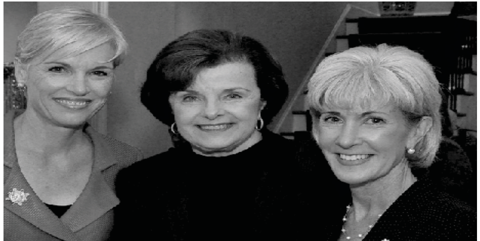
Health and Human Services Secretary Kathleen Sebelius (pictured right) was all smiles with pro-abortion Sen. Dianne Feinstein (D-CA) (center) and the nation's largest abortion chain President Cecile Richards (left) when ObamaCare was signed, giving Sebelius the power to order every American to pay for abortion pills as part of their health insurance premiums.

On top of that, all American taxpayers will also be forced to pay for abortion drugs