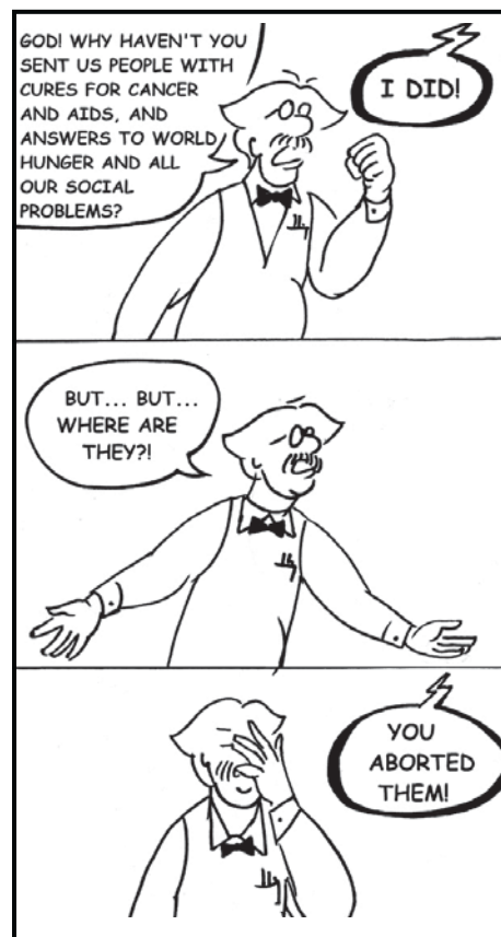
By passing a Life at Conception Act, Congress would eliminate abortion-on-demand by legislatively defining when life begins.

See Pro-Abortion Group Fears the Life at Conception Act . . . page 4