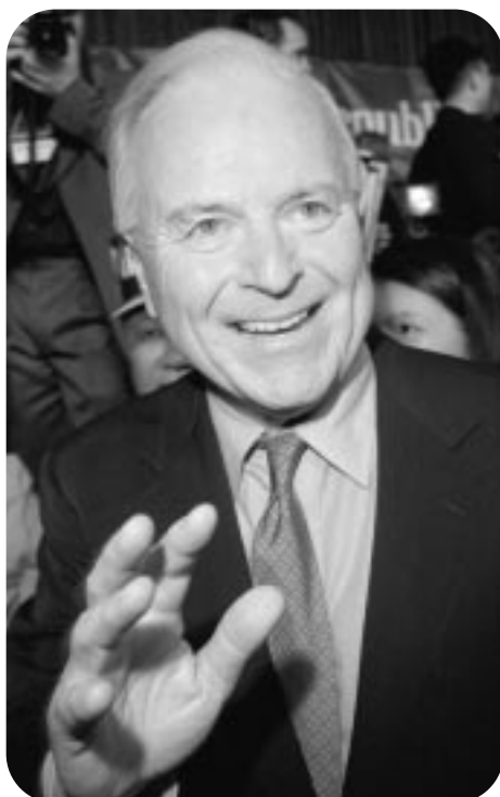
Pro-life Bill Simon (left) pulled a stunning upset in the race for California Governor over Los Angeles Mayor and abortion-on-demand supporter Richard Riordan.