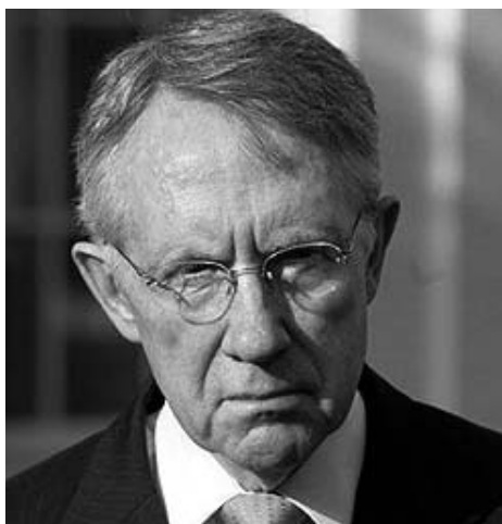
Senate Majority Leader Harry Reid (D-NV), while claiming to oppose abortion, has used his power to quietly kill pro-life legislation and channel billions of tax dollars to abortionists.