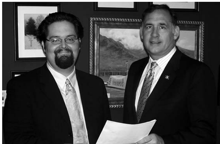
Congressman John Boozman (R-AR) discusses the Parental Notification and Intervention Act with National Pro-Life Alliance staff members. His bill would give parents in all 50 states the right to stop an abortion from being performed on their minor daughter.

For example, the nation's largest abortion provider, Planned Parenthood, recently launched a new program to get a jump on parental involvement by giving adolescents advice via "texting," a popular teen communication medium via cell phone text mes-