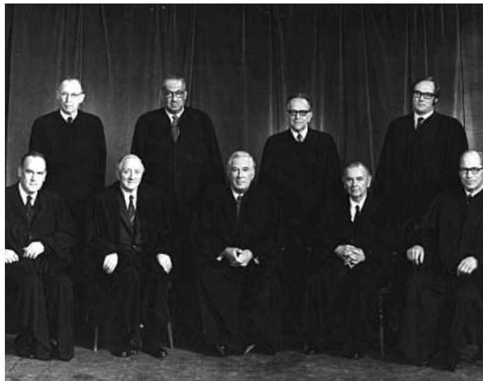
The 1973 Supreme Court infamously invented a Constitutional “right” to abortion. Though such a right never appears in the Constitution, countless federal judges have enforced the decision with a vengeance, striking down scores of laws restricting abortions.

In fact, Congress has repeatedly withdrawn jurisdiction from federal courts when