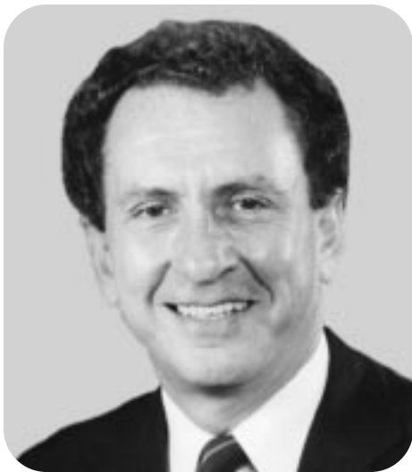
Pro-abortion Senator Arlen Specter (R-PA) is widely blamed by pro-lifers for the pro-abortion Supreme Court majority.