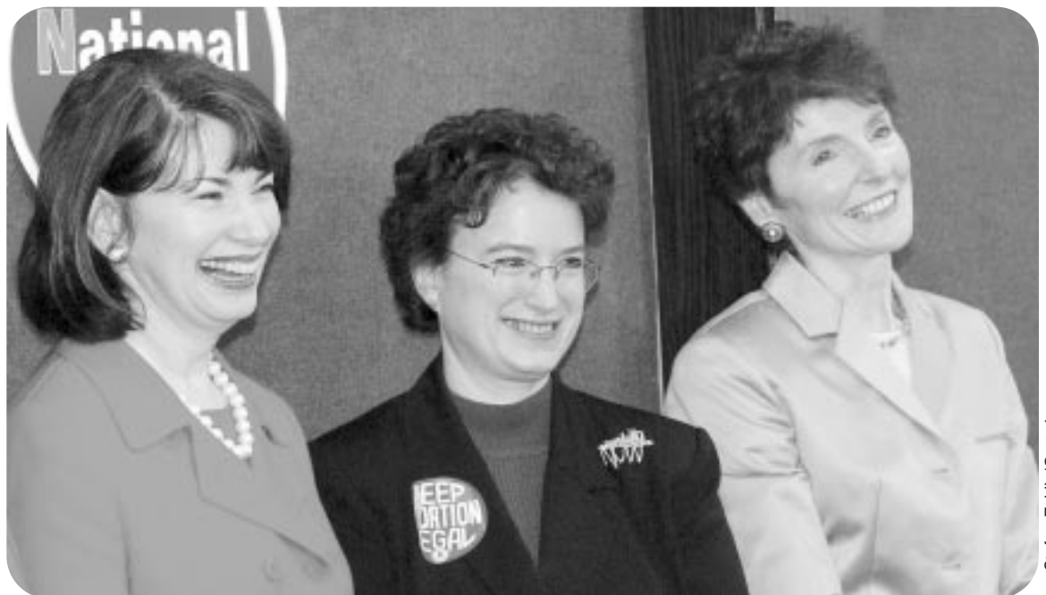
(L-R) Gloria Feldt (Planned Parenthood), Kim Gandy (NOW) and Kate Michelman (NARAL) have a no-holds-barred campaign to trash politicians who don't share their radical pro-abortion agenda. Extremist pro-abortion groups have promised to spend millions to seize control of Congress in the coming elections.