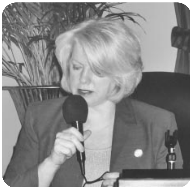
Congresswoman Marilyn Musgrave has contacted more than 3.1 million pro-lifers nationwide to mobilize their participation in NPLA's campaign to pass a Life at Conception Act.