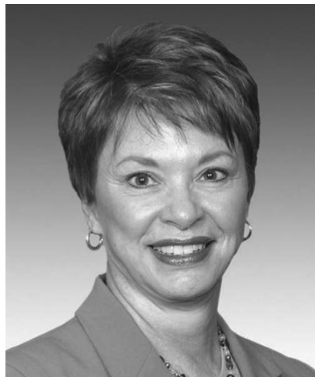
Barbara Cubin (R-WY)