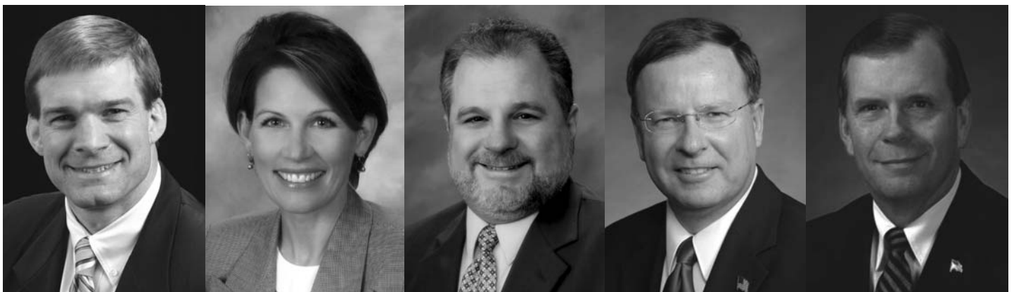
Jim Jordan (R-OH)