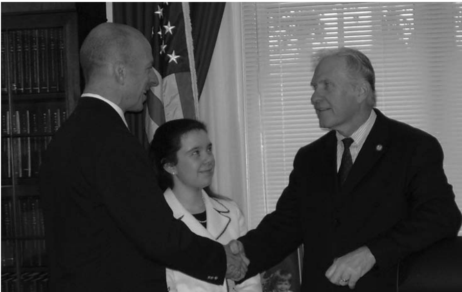
Life at Conception Act cosponsor Steve Chabot (R-OH), pictured above with members of NPLA staff, narrowly defeated his pro-abortion opponent with support from the National Pro-Life Alliance Political Action Committee (NPLA-PAC) and grass-roots pro-lifers.

And since a pro-life, anti- Roe majority on the Supreme Court remains out of reach even if the Court's newest members -- Judge Alito and Chief Justice Roberts --