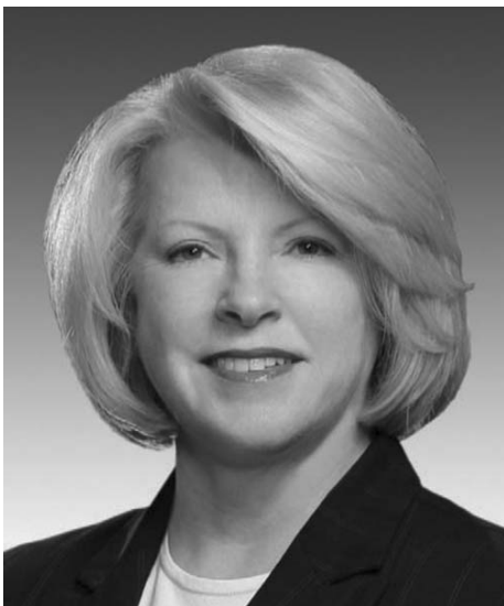
Marilyn Musgrave (R-CO)