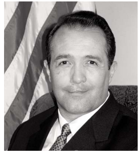
Congressman Trent Franks (R-AZ) will serve as the Life at Conception Act's primary sponsor in the House of Representatives.

ing to the United States Senate, Wicker was a frequent floor leader in House fights to end taxpayer funding of abortion providers. As a State Senator he authored a successful bill to strengthen Mississippi's parental involvement requirements.