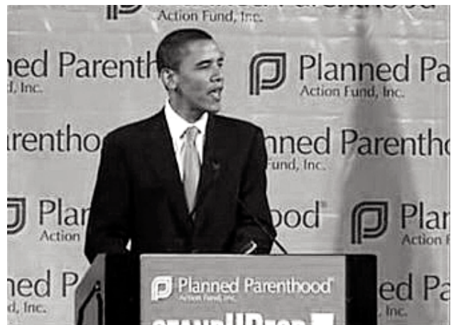
Obama pledged to a cheering group of abortion providers that his first goal in promoting abortion would be to sign the so-called "Freedom of Choice Act" into law.