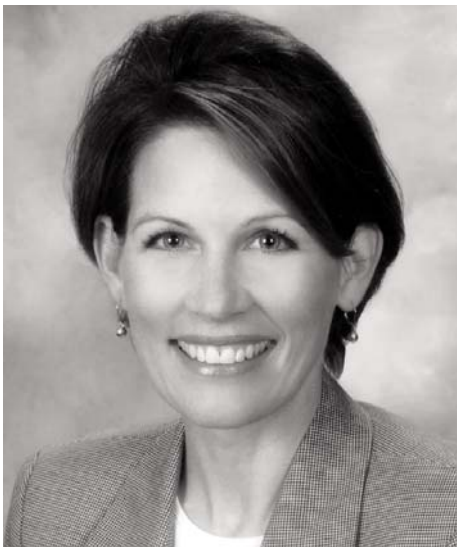
Michele Bachmann (R-MN)

See NPLA-PAC Again Tops Record... page 2