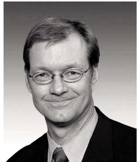
Blaine Luetkemeyer (R-MO)

National Pro-Life Alliance members provided financial support through the National Pro-Life Alliance Political Action Committee (NPLA-PAC) to numerous pro-life champions facing challenges from pro-abortion opponents. The grass-roots network mobilized by the Alliance's national Candidate Survey Program proved helpful to many pro-life heroes nationwide.