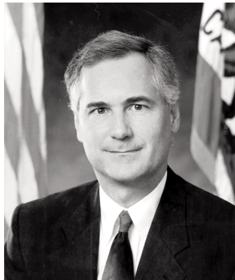
Tom McClintock (R-CA)