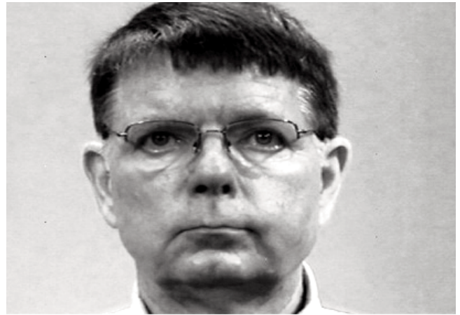
Partial-birth abortionist George Tiller, seen here in his police photo shot following his arrest on 19 criminal counts related to his abortion practice, would again exercise his grisly trade nationwide if the so-called “Freedom of Choice Act” were ever to pass.

After all, the Partial-Birth Abortion Ban passed by nearly two-thirds majori-